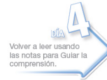
Volver a leer usando las notas para Gular la comprensión.

After reading, students are asked to retell the selection. They can use the EnVision It! retelling images in My Skills Buddy as a guide. Use the retelling or summarizing rubrics to monitor students' progress or assign a Story Sort from the digital path. A retelling plan located in the sidebar helps monitor students' progress from week to week.